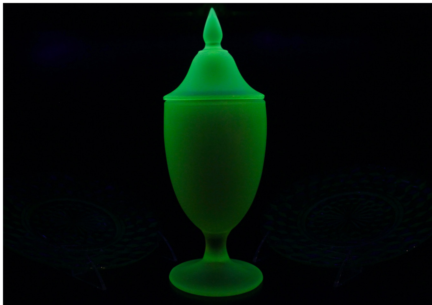
Cara Despain, under the rainbow, behind the curtain (2022), wood, antique depression glass and UV lights. Courtesy of the artist. Photo Credit: Cara Despain.

and raised — heavily researched by Despain to grasp the far-reaching implications of the legacy of nuclear testing.