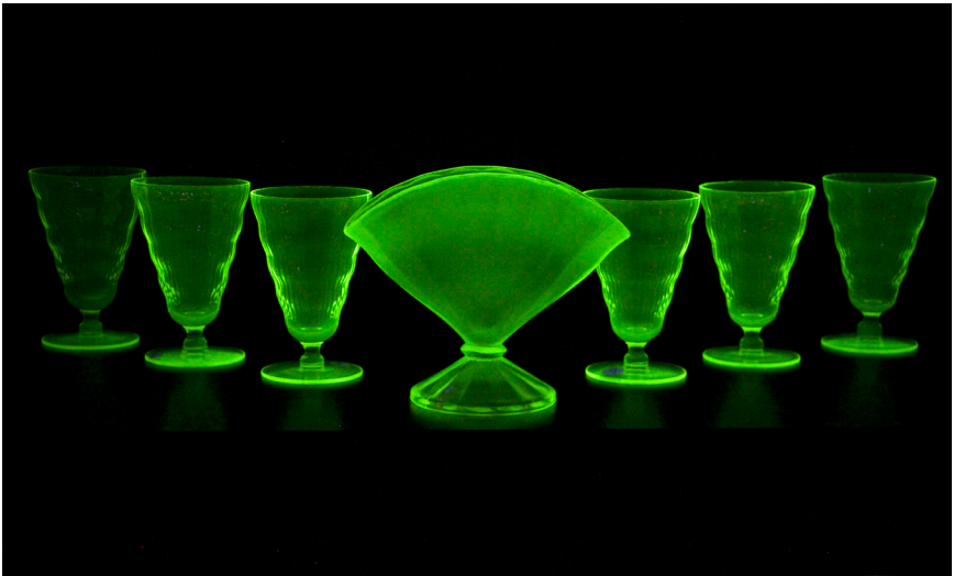
Cara Despain, under the rainbow, behind the curtain (2022), wood, antique depression glass and UV lights.

War. Impacts from both domestic uranium mining and atomic weapons testing were particularly devastating in the artist's home region, but also continue to reverberate across the entire globe to this day. Despain notes, " Specter is a glimpse into the quasi-spiritual, otherworldly, dark shared connection that quite literally radiated out from the day we first tested and continues to haunt the bodies of every living thing on the planet." It is an atmospheric monument to having irrevocably crossed the threshold into the Anthropocene, and into a nuclear age that continues to push us to an existential precipice.